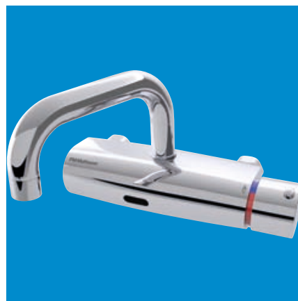
No Touch Tap