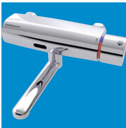
No Touch Shower