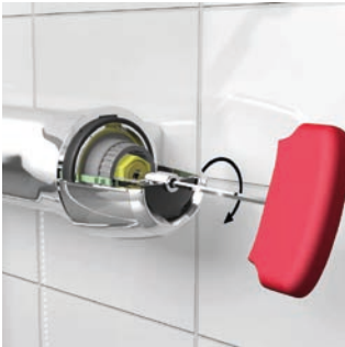
Thermal Speed Flush Cartridge