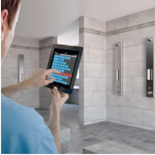
CNX Water Management System