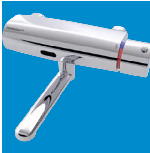
No Touch Shower